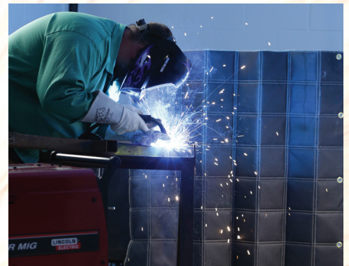
Can be used as a self-standing welding screen