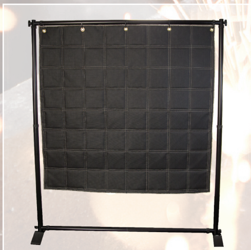
Available with grommets for hanging